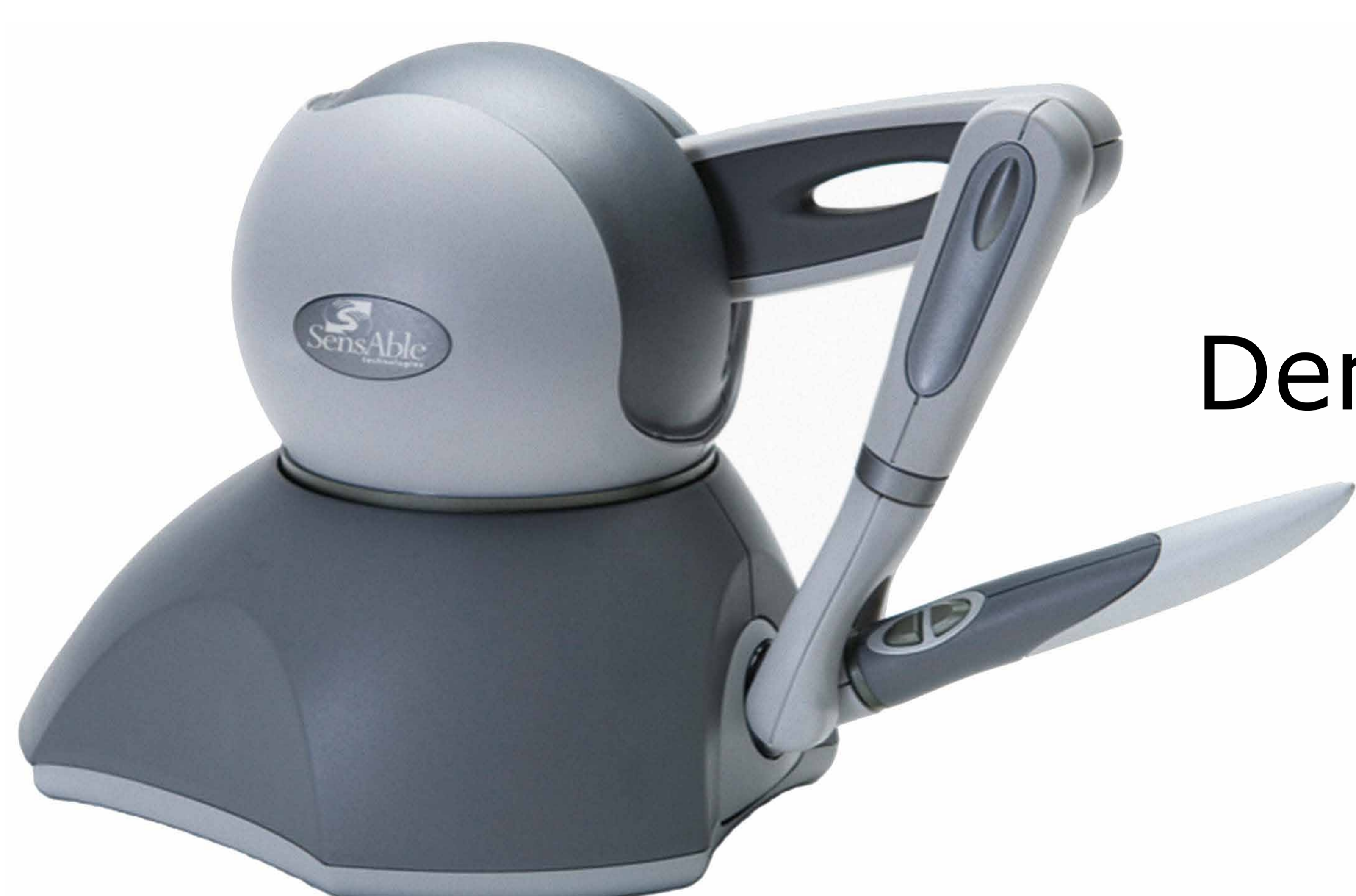
Den virtuelle kniv