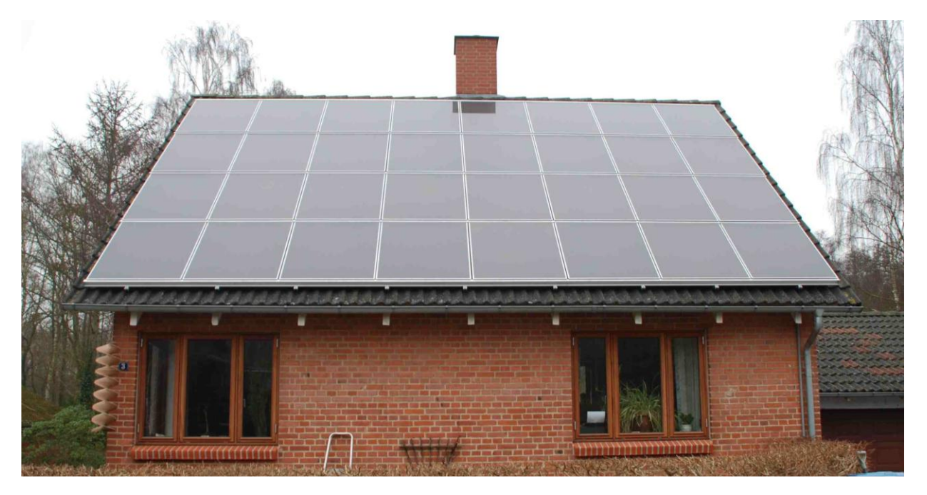
a-Si/ \mu c\text{-Si} modules mounted on south facing roof surface.

On this building located in Gjern in the central Jylland, 130 Wp a-Si/ \mu c-Si modules from the German manufacture Inventux have been utilized. In this particularly case, the owner of the house for architectural reasons wanted to have a PV plant that could cover the whole surface of the south side of the roof.