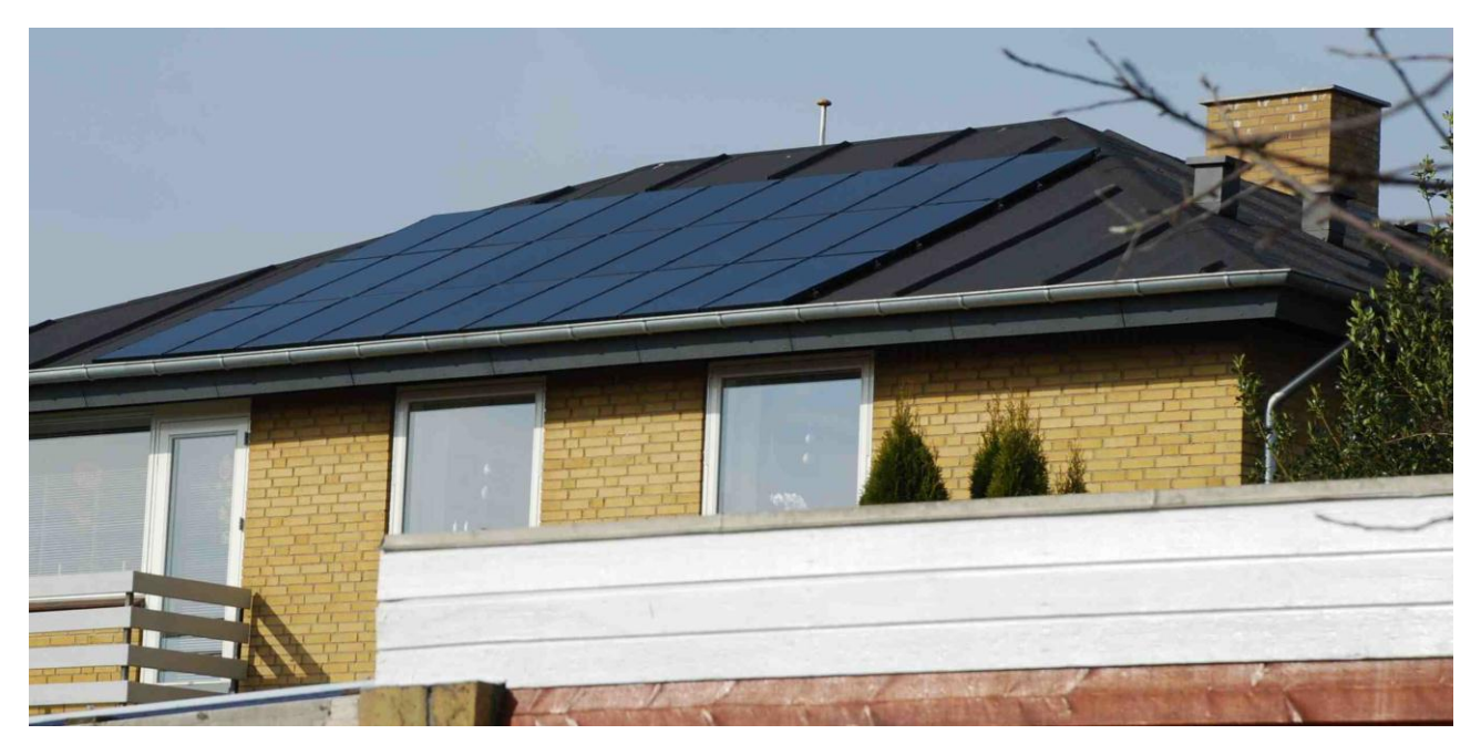
CIGS modules placed on south facing roof surface.

A total of 58 modules are placed on roof surfaces facing east and south. On the pictures below, the completed plant is shown.