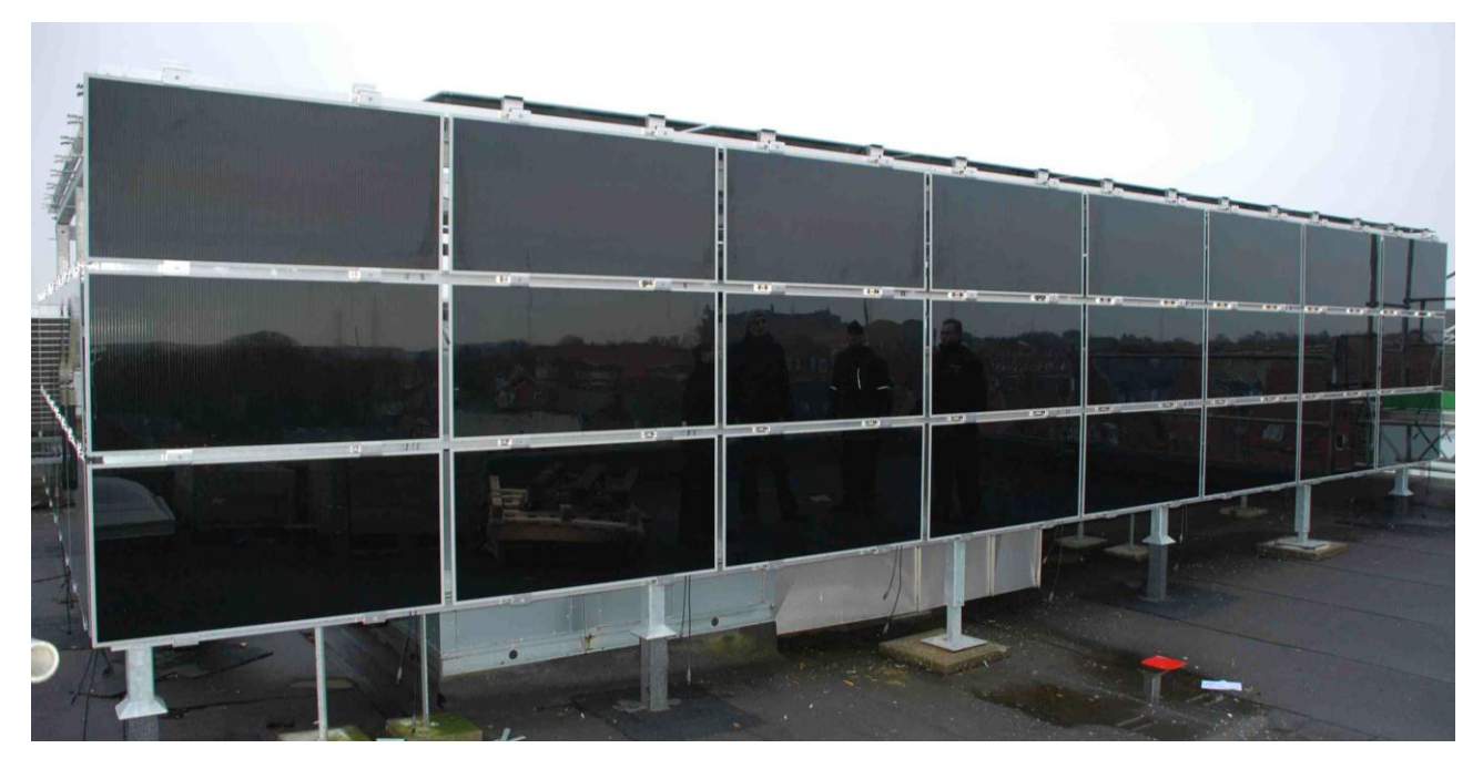
One of the ventilation plants being covered. Picture taken during installation.

The motivation to cover the ventilation units also on the upper side is mainly to raise energy production, since the horizontal mounting position is more productive compared to the various vertical positions utilized.