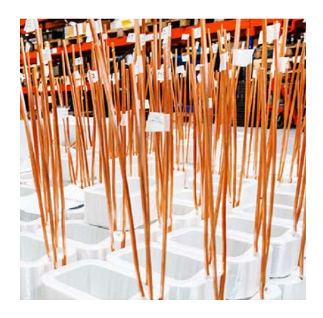
lean activities and continuous improvements will ensure high product quality and on time delivery even for large series of magnets.

By utilizing the factory in Jyllinge for series magnet assembly and testing, it will be possible to operate several assembly lines in parallel, and hence increase the production volume. The investment in new production equipment, and the introduction of