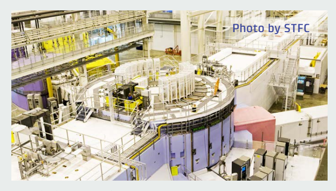
ISIS pulsed neutron and muon source – a pioneering research centre in the physical and life sciences, ISIS has an impact in fields such as energy, biotechnology, materials development and information technology.

A new power supply for the injection kicker magnet system at the ISIS neutron source at STFC's Rutherford Appleton Laboratory, UK, is being designed and manufactured by Danfysik. A linear accelerator accelerates H<sup>-</sup> ions to 70MeV which are then injected into the synchrotron via four injection dipole magnets. When the dipoles are energized (see specs in the box below), the beam passes through a stripping foil, allowing only the protons to pass. The protons are accelerated up to 800MeV in the synchrotron before they are extracted to one of two target stations. The extracted beam will deliver protons in two 100ns long pulses to the neutron and muon targets.