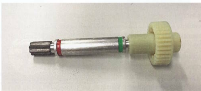
Figure 4: Example of a key quality control test of the star shaped axis of the plastic part. The plastic parts produced using the laser textured inserts fulfilled this quality criterion, even after reducing the cooling time by five seconds.

The validation test showed that the cooling time can be reduced by 5 seconds when the laser textured insert is used instead of a standard surface-finished insert. Thus, the total injection cycle time could be reduced from 33 seconds to 28 seconds, corresponding to a productivity gain of 15 %.