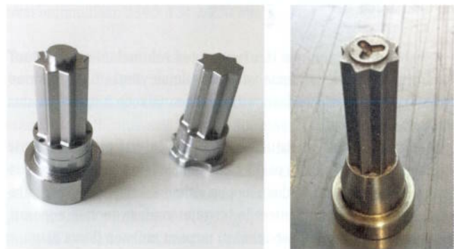
Figure 1 Left: Original star-shaped inserts of the production mould. Right: Test insert for studying the effect of surface treatments on the demoulding properties. All parts are made in stainless steel (1.2379).

A series of tests was made using star shaped cores made of K110 Böhler Steel (1.2379) and using seven different polymers. A series of cores was modified by laser texturing strategies to obtain different surfaces to be tested in real injection processes. Here, the laser textures are described by their corresponding surface roughness ( S_a ). The roughness scale was chosen to cover surfaces with low values of S_a (0.5–0.9 \mu\text{m} ). Although the surface topography cannot be defined only by its roughness value, a trend was observed.