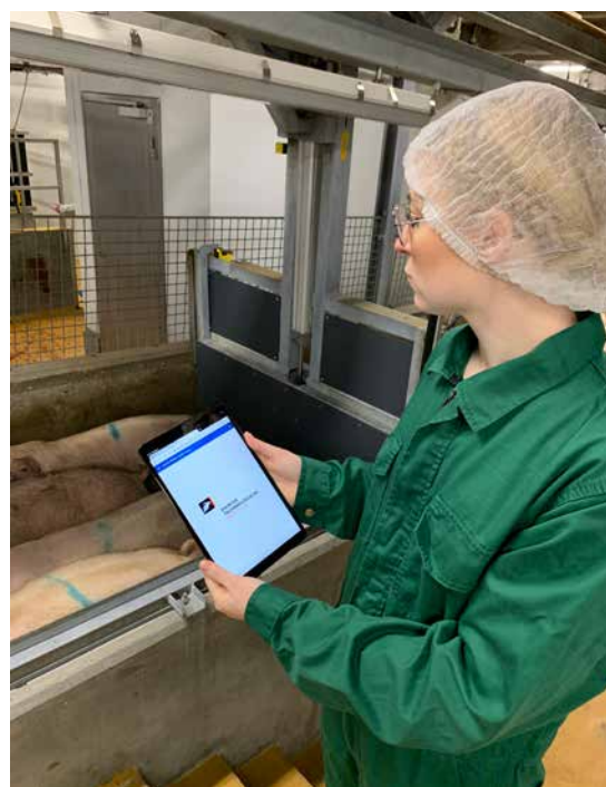
By use of the WQC app the slaughterhouse will be able to continue to monitor animal welfare after DMRI's experts have left.

The concurrent training of slaughterhouse employees ensures implementation of the WQC system and the app as well as ongoing focus on animal welfare.