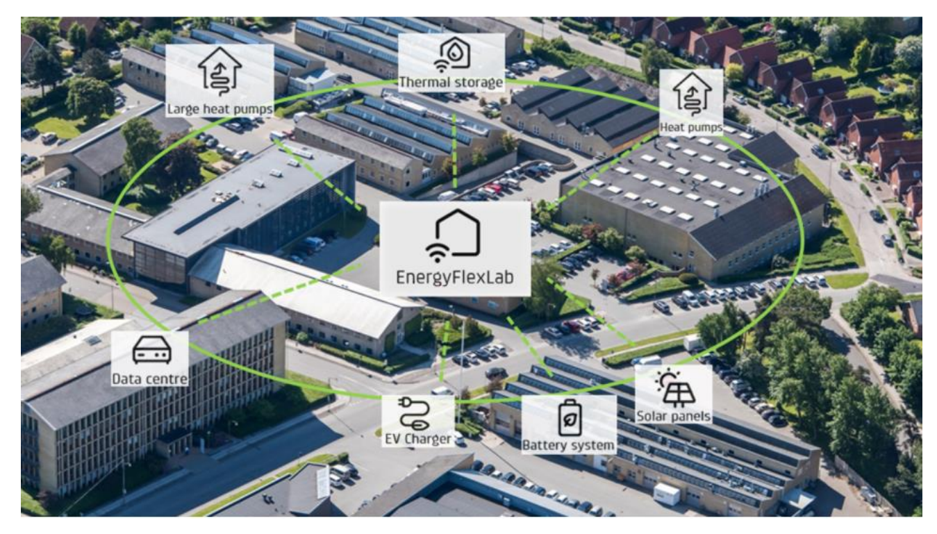
Figure 1: Main components in EnergyFlexLab.