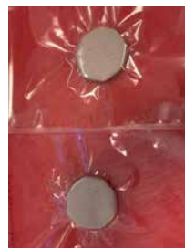
Gas production in vacuum-packed deli meat inoculated with a Leuconostoc cocktail.

Blown packs of deli meat were obtained from Danish retailers and dominating gas producers were identified using whole genome sequencing (WGS). WGS was performed on an Illumina MiSeq platform using the Nextera XT DNA library preparation kit (Illumina). Bioinformatic analysis was performed with the CGE online bioinformatic tools ( http://www.genomicepidemiology.org/services/ ; DTU-FOOD). In all heat-treated deli meat samples (n=12) Leuconostoc carnosum or Leuconostoc mesenteroides were isolated.