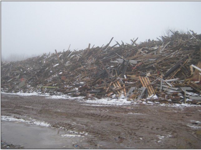
Figure 2. The original wood waste lot as received at the deposit.

total primary sample mass of 12 tons. If the capacity had been only 15 tons per hour and increments were taken, e.g., every thirty minutes, approx. 80 increments corresponding to eight tons of material would have been gathered.