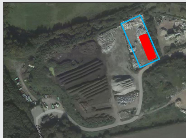
Figure 1. Overview of deposit site (Google maps). The area where the wood waste was placed and handled is marked with blue. The lot comprised the red area.

In close cooperation with the workforce at the waste deposit, it was decided that mass reduction could be performed via the one-dimensional stream throw-off from the shredder, Figure 4.2. Increments of a minimum of 100 kg could be taken by using a front loader. The increments were all placed in a separate pile for later additional size and mass reduction treatment, Figure 5.1. The importance of strip mixing (bed blending) should be emphasised