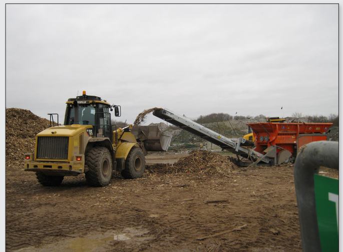
Figure 4. (a) Loading the shredder at step 1. (b). Extraction of increment at step 1. Each increment is approx. 75kg, extracted every 10-15 minute.