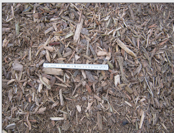
Figure 6. (a) Extraction of increment at step 2 (size reduction to a particle size below 5-10 cm). (b) Particle size after size reduction step 2. A 20 cm ruler for scale.

sample was placed in a large plastic bucket, sealed and marked before further handling in the laboratory.