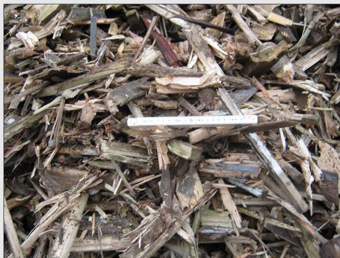
Figure 5. (a) The accumulated primary sample lot (approx. 20 m 3 ). (b) Particle size distribution after primary shredding at step 1 (see Figure 3). A 20 cm folding ruler for scale.