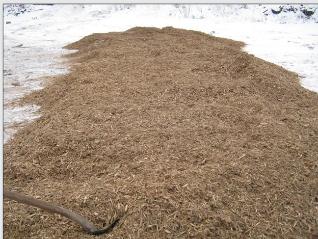
Figure 7. The composite secondary sample lot flattened to a maximum height of 50cm. 50 increments were taken at randomly selected locations and depths (using a shovel), making up the final composite sample of 10kg.

It could probably always be discussed whether the number and size of increments in relation to “particle size” are adequate. In this case, they were considered appropriate based on experience, knowledge from EN 14780 1 and a sound judgement on site.