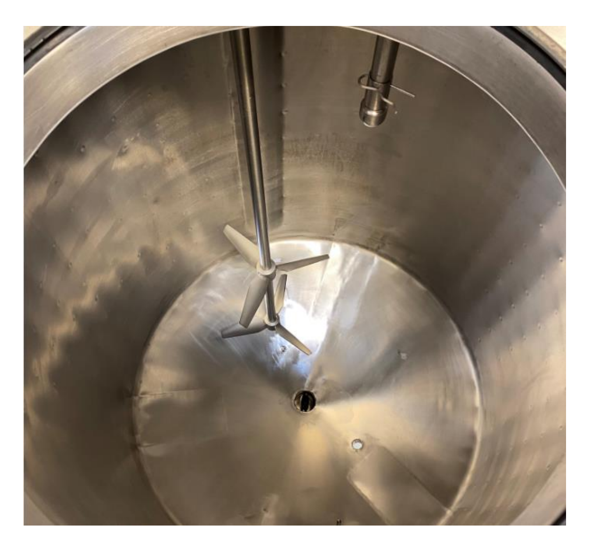
Danish Technological Institute